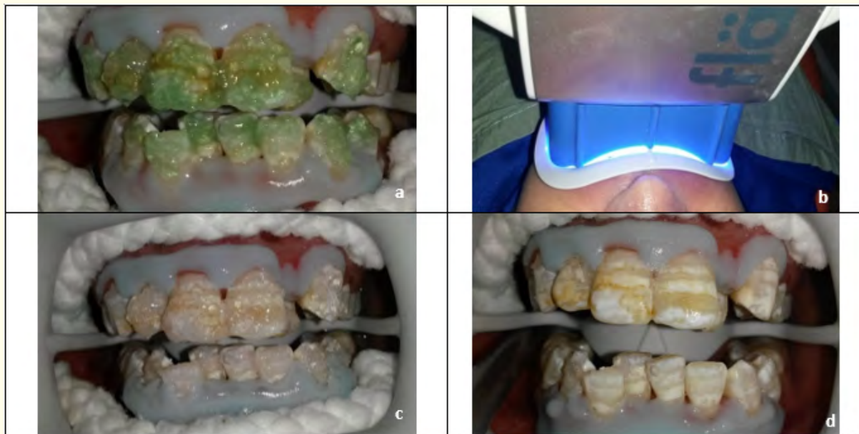
Figure 4: Application of the 32% flash peroxide gel on the buccal surface of the premolars and anterior teeth (a); Next, activation of the gel with the Flash Whitening Lamp for 15mn (b); Change in the color of the gel(c); Then, the gel can be removed first with an aspirator tip and cleaned with some gauze (d). The same steps from (a) to (d) are repeated two more time.

Later, green colored 32% hydrogen peroxide (flash® White-Smile) was applied to cover the buccal surface of all the anterior teeth plus the pre-molars. The gel was then activated with the flash high-power LED Whitening Lamp (WHITEsmile®). The lamp was set on pulse program for 15 minutes. Then, the gel changed its color showing that it has lost its active state (Figure 4).