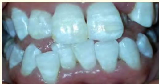
Figure 9: The result after 2 weeks of home bleaching.