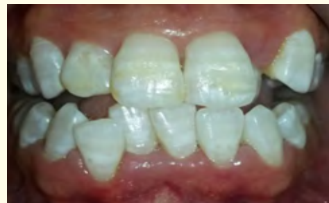
Figure 10: The result after 6 months.