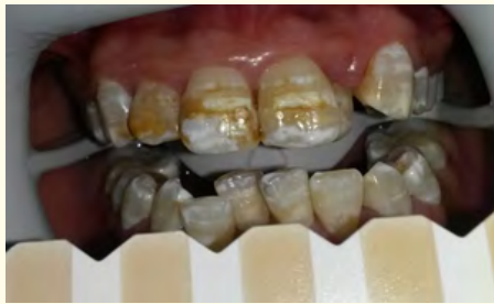
Figure 2: Color shade selection using the color shade guide or the bleaching kit.

First, the tooth color shade was verified using the color shade guide of the flash® in-office bleaching by visual examination (Figure 2).