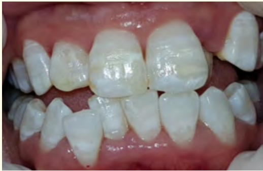
Figure 11: The result after 18 months.