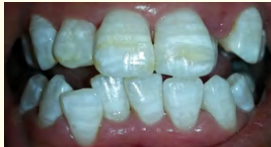
Figure 7: One week after bleaching; notice the stability of color.

The patient was received 7 days later for a follow-up (Figure 7). In order to remove persistent yellowish spots and maintain long-term results, we decided to carry on an ambulatory treatment using the home whitening of WHITeSmile® Germany. To perform this, special maxillary and mandibular full arch trays were constructed and fitted to the patient (Figure 8).