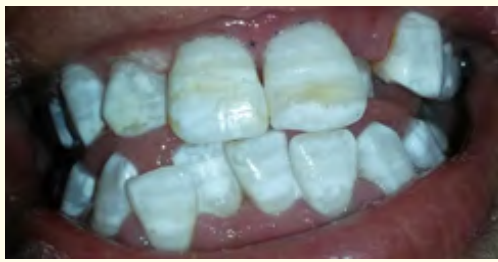
Figure 5: Final result after in-office bleaching.

At the end of the treatment, we applied the After Whitening Mousse (WHITeSmile®) over the teeth to prevent any sensitivity following bleaching (Figure 6). The patient was also given a Whitening toothpaste (flash® White-Smile) containing 1100 ppm fluoride to act against any sensitivity at home.