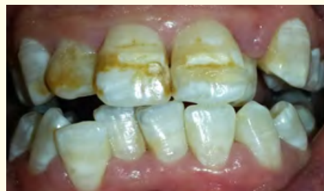
Figure 1: Initial case: Notice the severe fluorosis according to (DI).

A 24 year old female was referred to the Department of Dental Medicine for a dental bleaching treatment. It was the first time she requested this cosmetic procedure. The examination revealed good oral hygiene with no carious lesions. The vitality test was positive for all anterior teeth. Anamnesis on the fluorides revealed that the patient is from a city where water concentration in fluorides is high. So, after anamneses and clinical examination, the patient was diagnosed with severe fluorosis according to modified Dean Index (DI) (Figure 1) using the criteria recommended by the World Health Organization (WHO). As the patient wanted to have the most conservative treatment possible, we opted for in-office bleaching regimen with 32% hydrogen peroxide and light activation (WHITEsmile Flash®) combined to an ambulatory treatment with WHITEsmile home bleaching®.