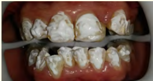
Figure 6: Application of the after-whitening mousse.

At the end of the treatment, we applied the After Whitening Mousse (WHITeSmile®) over the teeth to prevent any sensitivity following bleaching (Figure 6). The patient was also given a Whitening toothpaste (flash® White-Smile) containing 1100 ppm fluoride to act against any sensitivity at home.