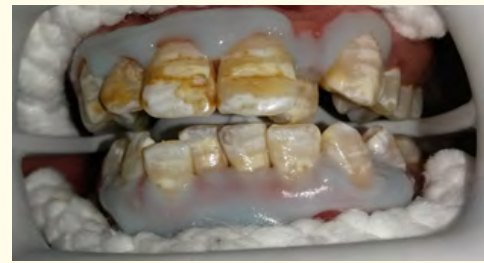
Figure 3: Isolation of the teeth using a lip retractor and a light-curing liquid Dam (Gingiva protector flash®).

the contour of the gingival tissue in an attempt to avoid contact between the bleaching agent and the gingiva (Figure 3).