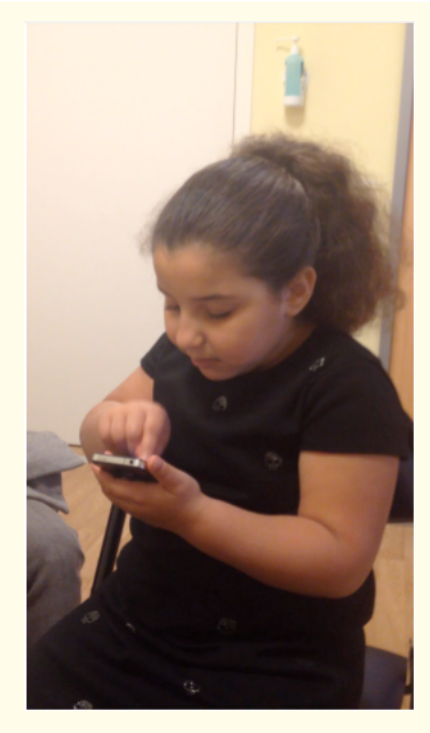
Figure 1: Related attention-deficit disorders.