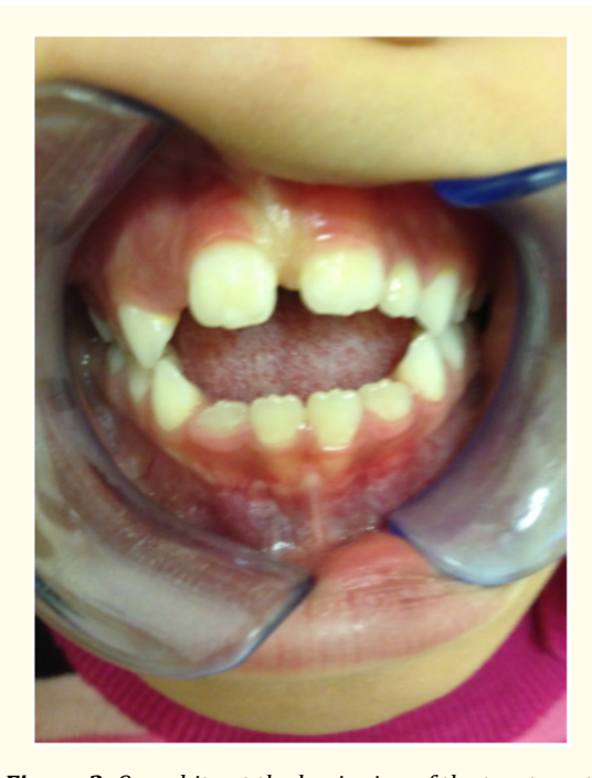
Figure 2: Open bite at the beginning of the treatment.