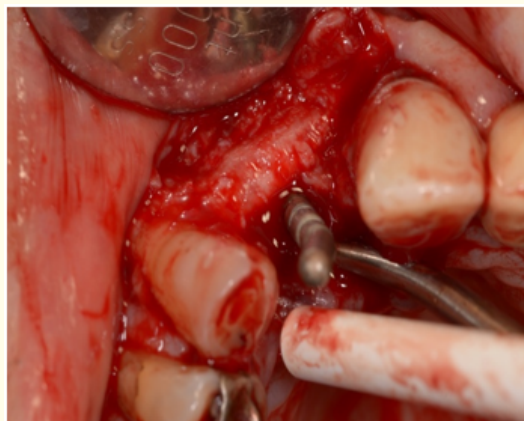
Figure 4: Surgical implant placement (11).