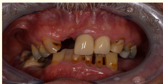
Figure 1: Patient post-surgical treatment of oral cancer.

This case was successful in achieving the aims and objectives of restoring a patient that underwent oral cancer treatment to address his aesthetic and functional concerns in a manner that was predictable and holistic. However, many factors needed to be considered in his previous history of Cancer treatment. Even though radiotherapy is related with higher rates of implant failure [3]. The Implant procedure performed had no complications and healing was uneventful after 6 months post-surgery. This in part was due to proper treatment planning and surgical placement of implants in moderate dosage fields (40 GY). Mechanical complications were also discussed such as fracture of the abutment, loosening of the abutment screws, and food impaction. The position of all implants allowed the final restoration to be screw retained and so improved retrievability. The prosthesis were designed to facilitate oral hygiene and ensure the maintenance of implant health. After completion of treatment, the patient would be reviewed at 6 months to assess the following: plaque control; peri-implant probing depth; bone loss; occlusion; presence of soft tissue inflammation. If the patient manages to maintain his low caries rate, then the prognosis of the remaining dentition is good.