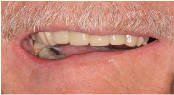
Figure 6: Final restored dentition.