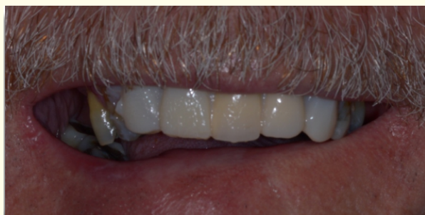
Figure 2: Mock-up with try in.