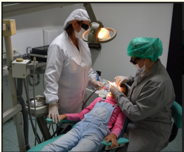
Figure 3: Biosafety practices inherent to the use of laser in dentistry.

The area of the lingual frenum was gently removed with controlled lateral movements (Figure 4) and the carbonized tissue was carefully removed with wet gauze (Figure 5). Tissue removal was evaluated according to the lingual movement, by laterality, elevation and extrusion (Figure 6). Immediately after the total removal of the fibrous tissue, the fiber of the equipment was changed and the area was irradiated in a punctual way with the low power laser (P = 100 mW), in order to cover the whole extension of the surgical site (3 J per point). The post-surgical laser therapy was performed with the purpose of promoting the photobiomodulation, which provides the acceleration of the healing process and the reduction of inflammatory symptoms.