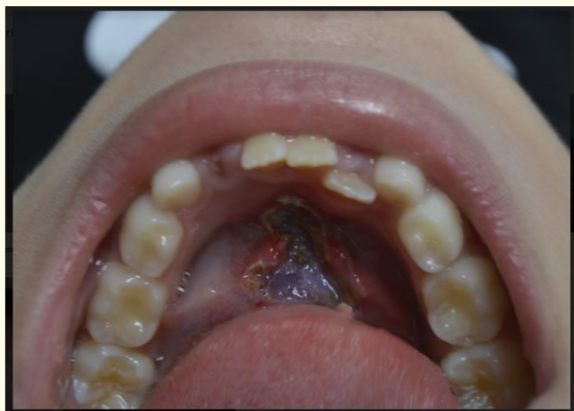
Figure 6: Immediate post-surgical: evaluation of the lingual movements.

After 30 days post-surgery, tissue repair of the site was observed and no complaints or discomfort were reported by the patient in the immediate postoperative period.