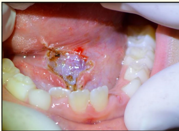
Figure 5: Carbonized tissue was carefully removed with wet gauze.