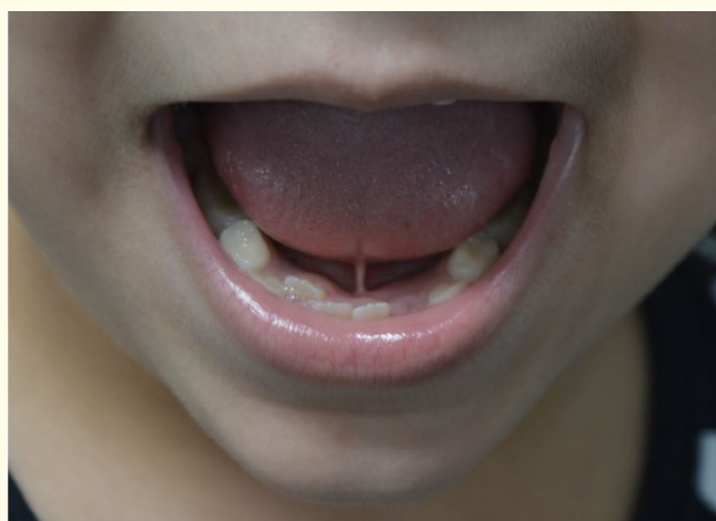
Figure 1: Lingual frenum: upper view.

Clinically, the patient presented persistent lingual frenum with insertion in the lingual mucosa in the region of the mandibular symphysis (Figure 1). Periodontal health adjacent to the surgical site was observed and no systemic changes were reported.