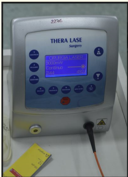
Figure 2: Diode laser.